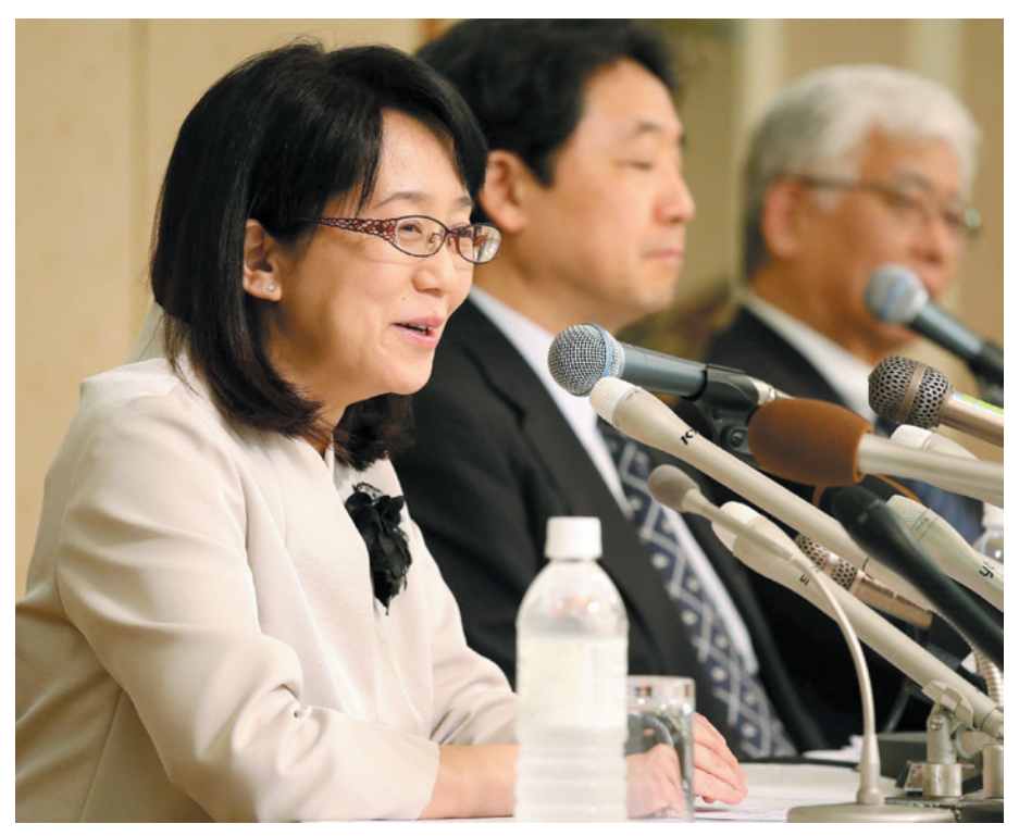
Masayo Takahashi is the first to implant tissue derived from induced pluripotent stem cells into a person.

CONSERVATION Fishing contest that fights an invasive species p.294